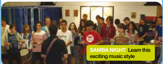
SAMBA NIGHT Learn this exciting music style