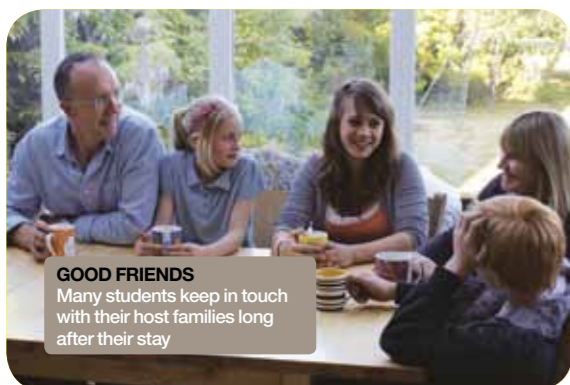
GOOD FRIENDS Many students keep in touch with their host families long after their stay

The school has recommended curfew times (when students should be home). Host families take their responsibilities very seriously, and we expect students to be home by these times. Whenever a student goes out in the evening when a school activity is not taking place, they should inform the hosts where they are going and at what time they intend to be back. Please contact us for further details or to request our booklet on accommodation for teenagers.