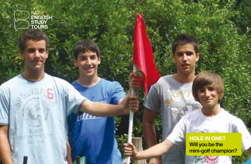
HOLE IN ONE? Will you be the mini-golf champion?