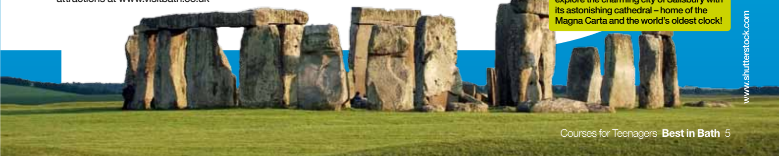
STONEHENGE AND SALISBURY Your chance to visit the world-famous prehistoric stone circle of Stonehenge and discover how and why it was built. Then explore the charming city of Salisbury with its astonishing cathedral - home of the Magna Carta and the world's oldest clock!