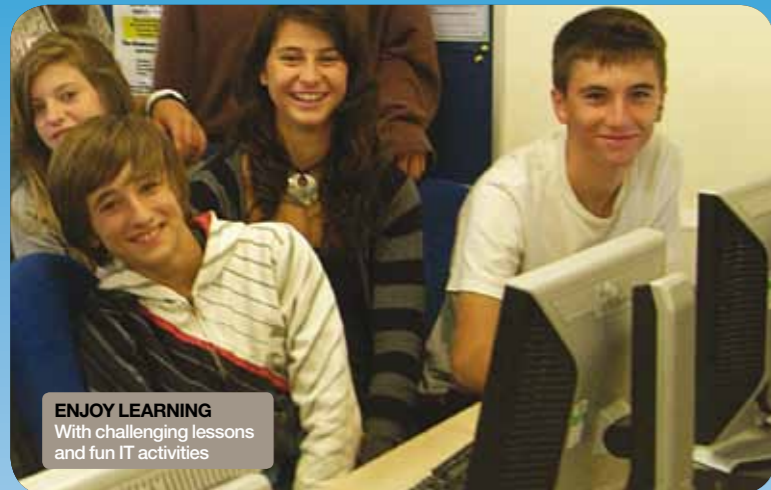
ENJOY LEARNING With challenging lessons and fun IT activities