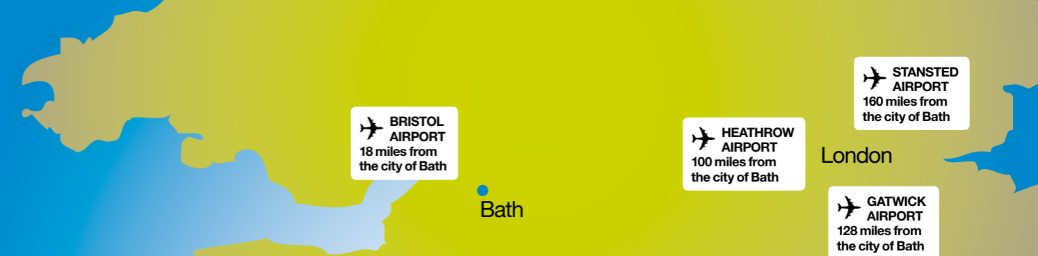
BRISTOL AIRPORT 18 miles from the city of Bath