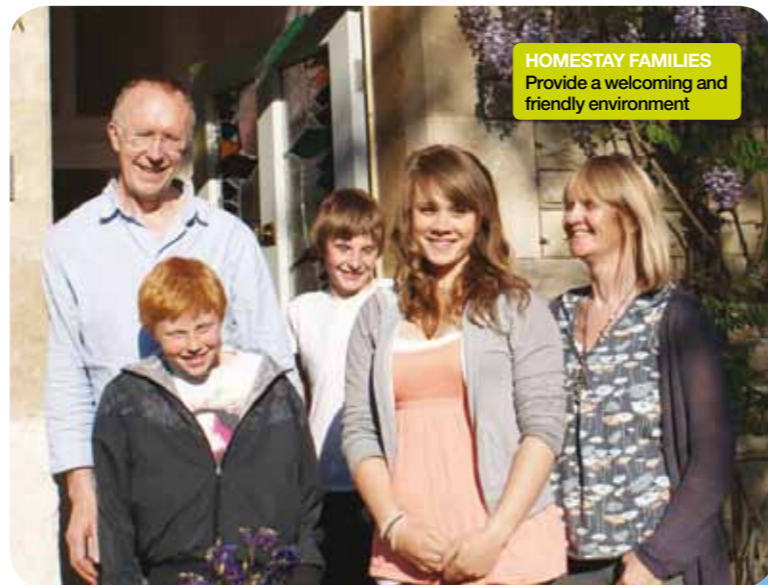
HOMESTAY FAMILIES Provide a welcoming and friendly environment

Accommodation is in single or twin rooms, with a maximum of four students per family, though most have one