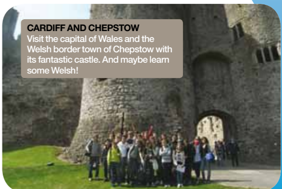
CARDIFF AND CHEPSTOW Visit the capital of Wales and the Welsh border town of Chepstow with its fantastic castle. And maybe learn some Welsh!

Check out what the city has to offer, and the wide range of cultural and social attractions at www.visitbath.co.uk