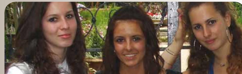
BEST FRIENDS Make friends for life!