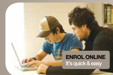
ENROL ONLINE It's quick & easy

Please see the brochure insert for further details, or contact us if you are arriving at a different airport.