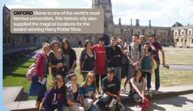
OXFORD Home to one of the world's most famous universities, this historic city also supplied the magical locations for the award-winning Harry Potter films