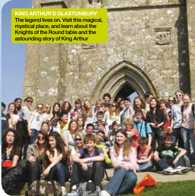
KING ARTHUR'S GLASTONBURY The legend lives on. Visit this magical, mystical place, and learn about the Knights of the Round table and the astounding story of King Arthur