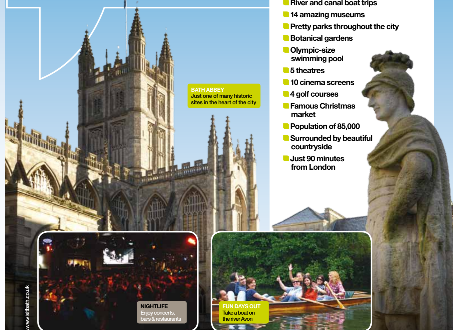
BATH ABBEY Just one of many historic sites in the heart of the city