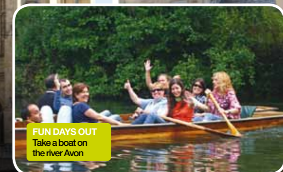
FUN DAYS OUT Take a boat on the river Avon