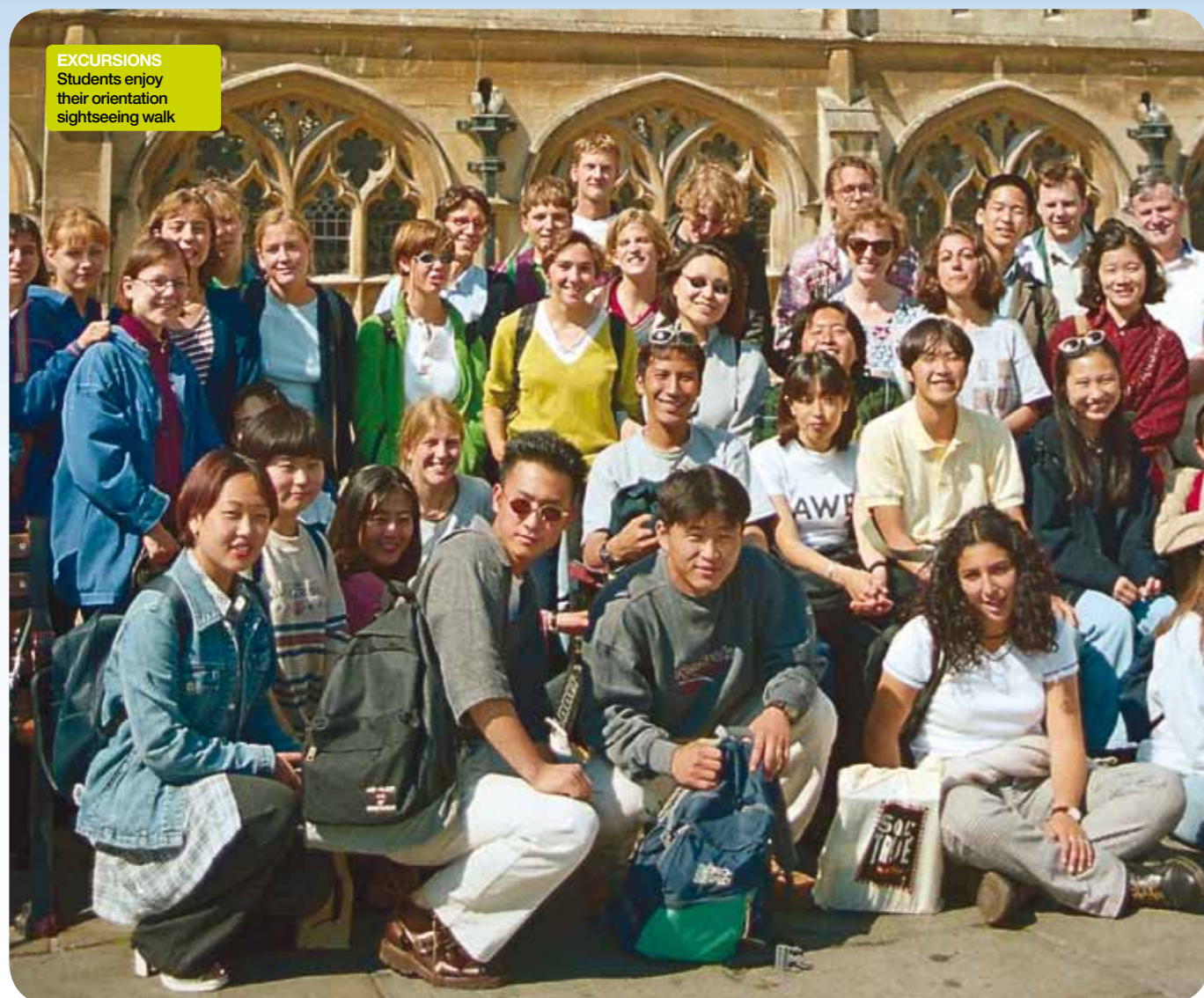
EXCURSIONS Students enjoy their orientation sightseeing walk