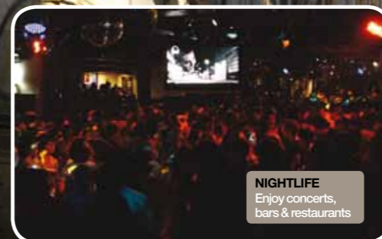
NIGHTLIFE Enjoy concerts, bars & restaurants